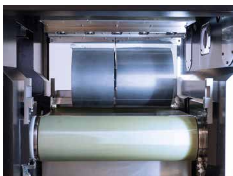
Long load length for high output