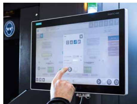
Easy operation for higher yield